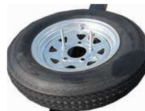
13" spare tire

Mounts with U bolts onto any cross member.